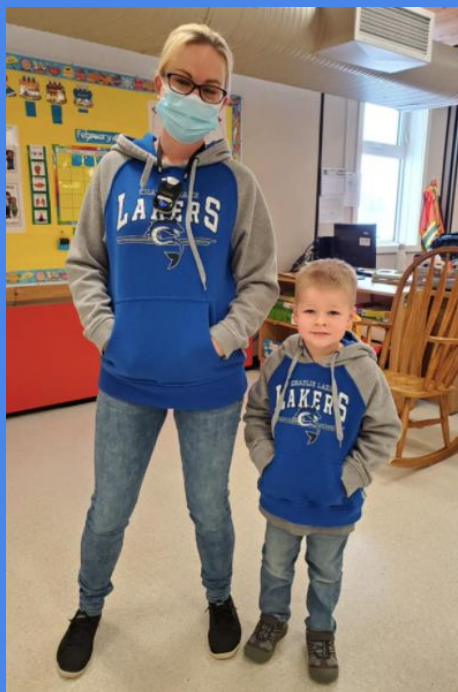
"You know what to do, wear your Laker blue!"